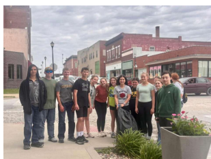
Union County Development Association