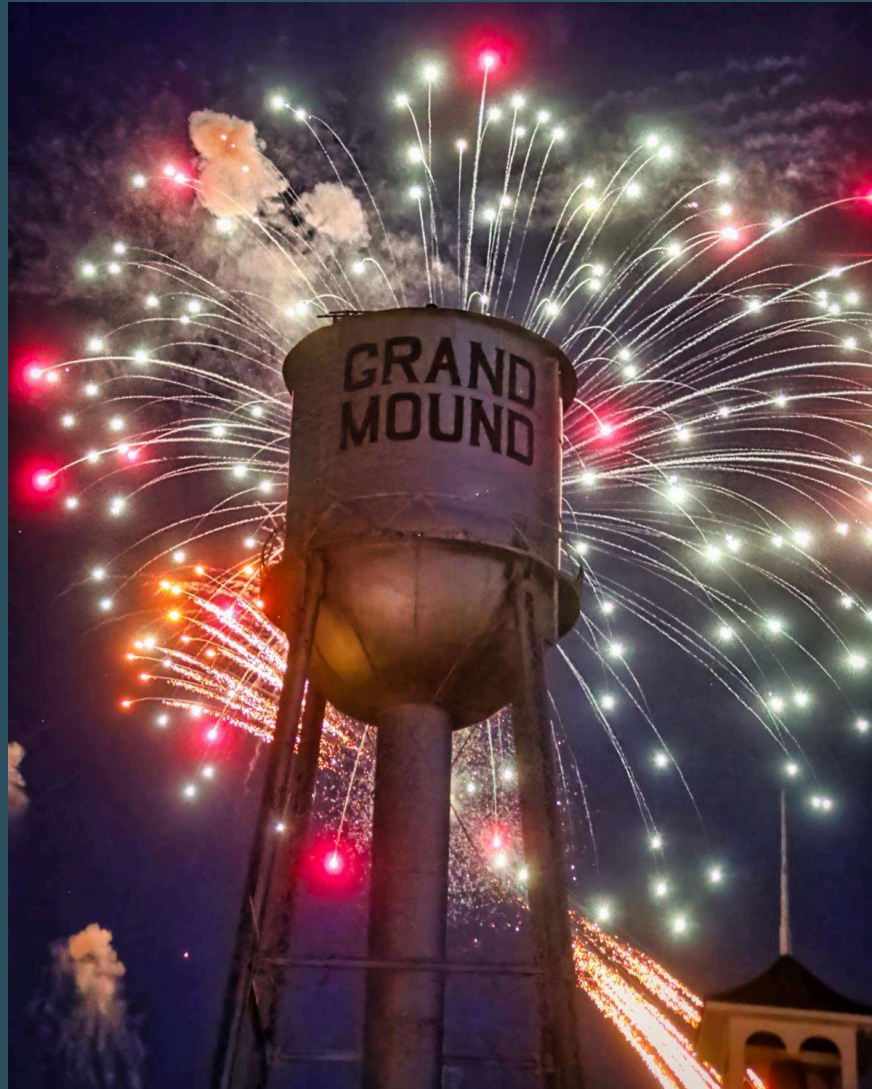
"Glitter City," 1st Place Iowa Cities and Public Favorite