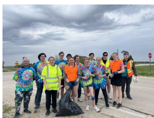
Pocahontas Hometown Pride