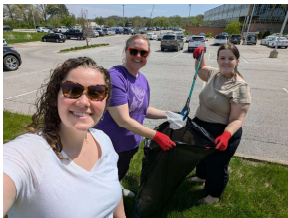
Iowa Economic Development Authority