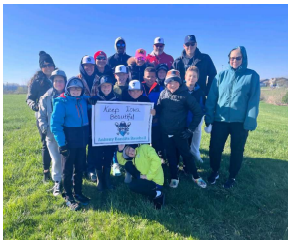
Ankeny Bandits Baseball