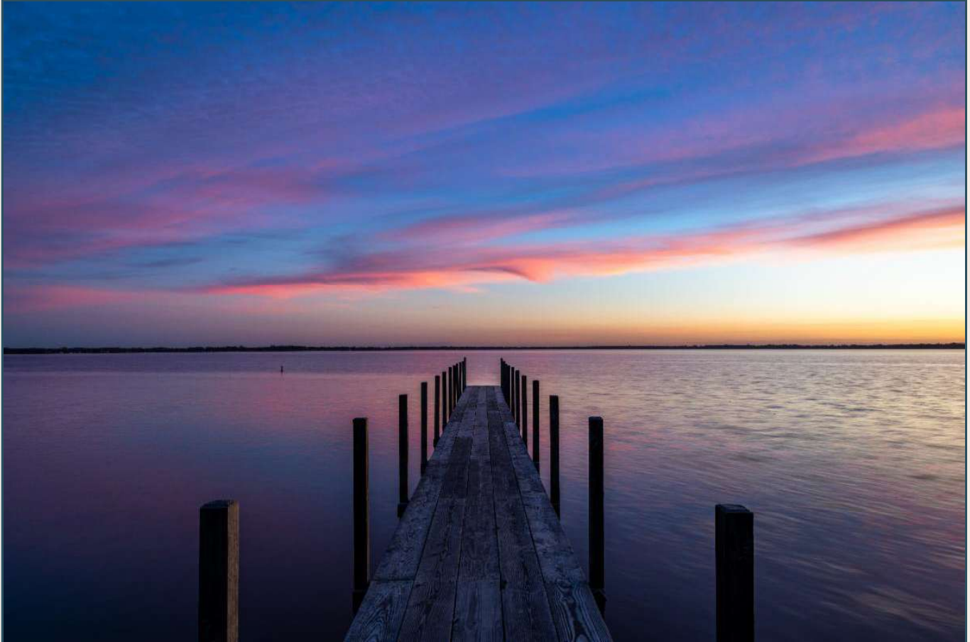
Photo Credit: "Dock to Serenity," William Beardsley of Spirit Lake 3rd Place Iowa Water