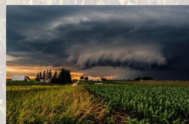
Storm Near Parkersburg